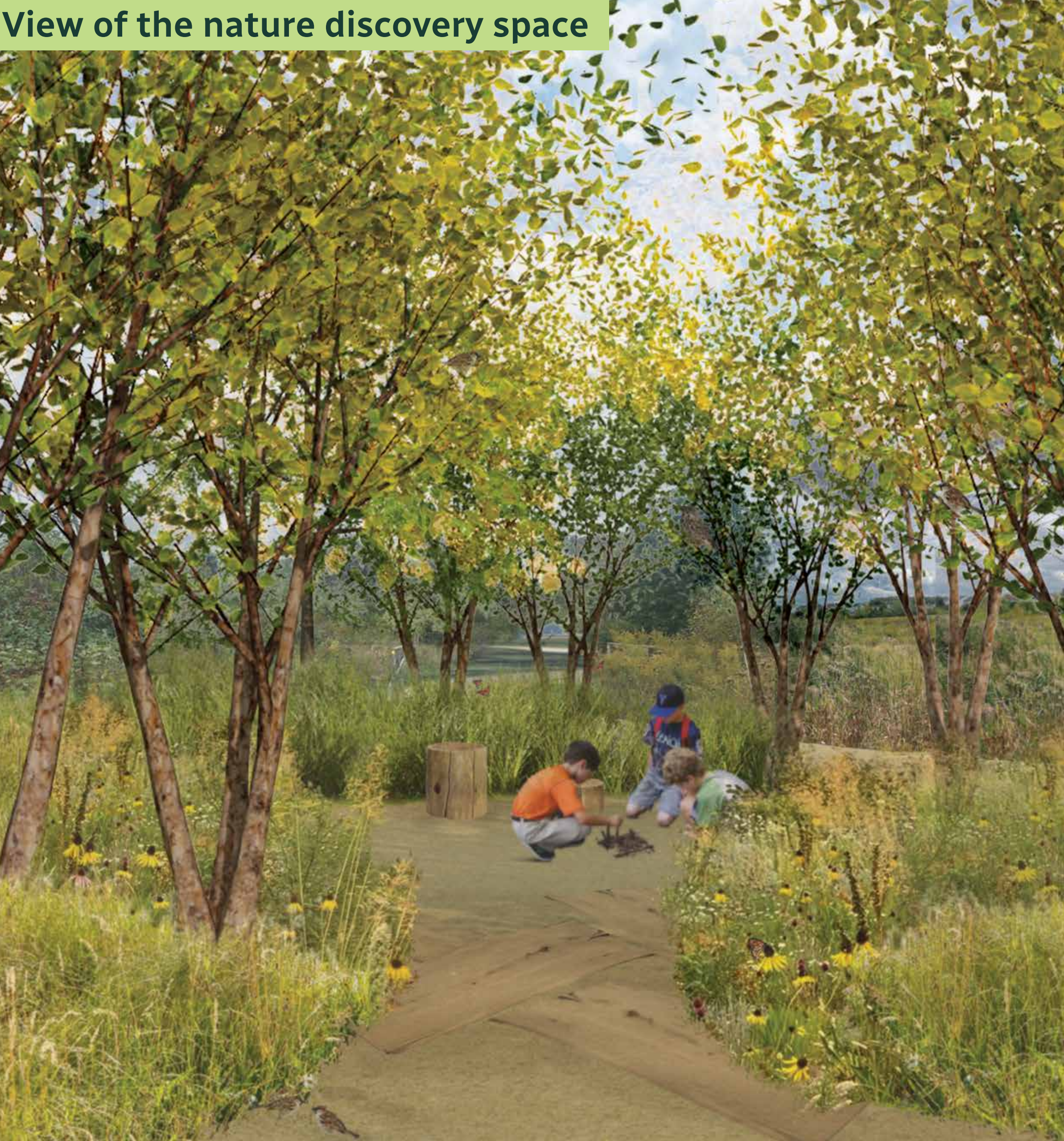
View of the nature discovery space