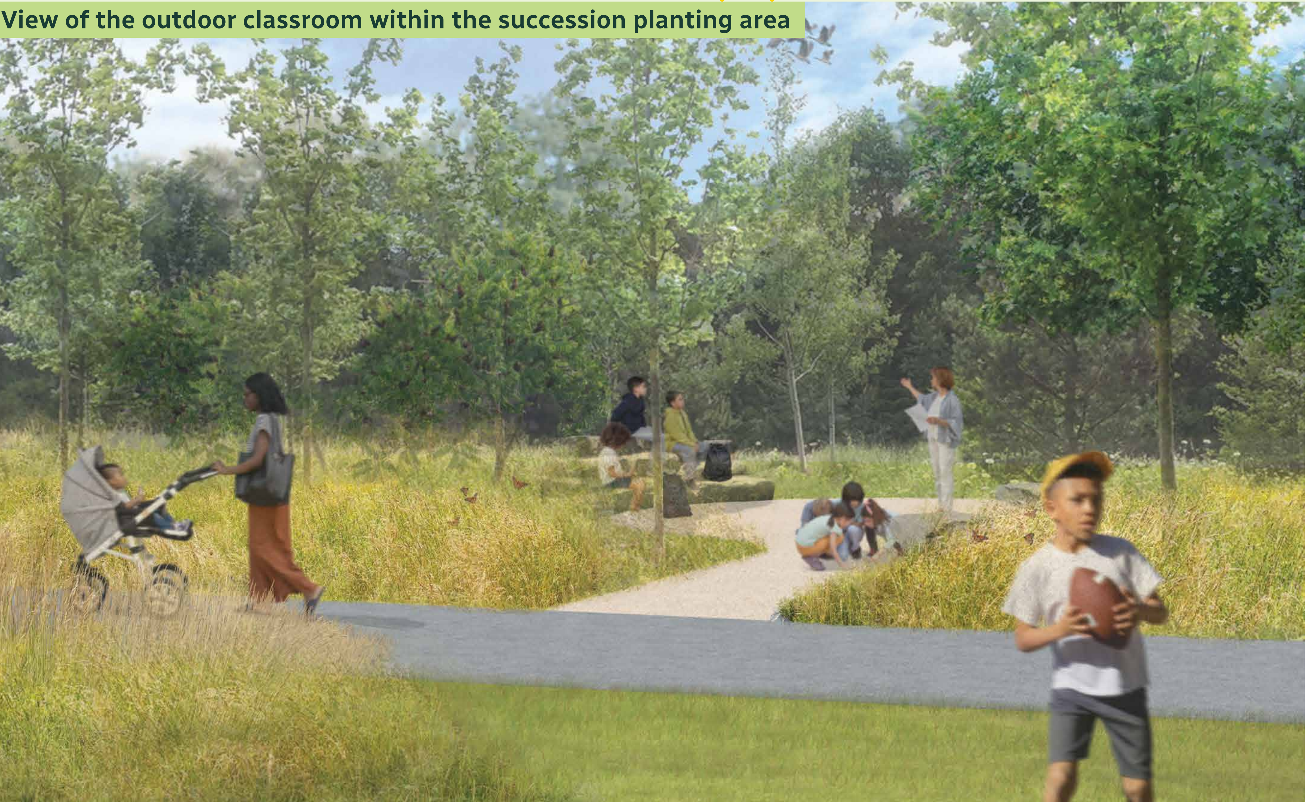
View of the outdoor classroom within the succession planting area