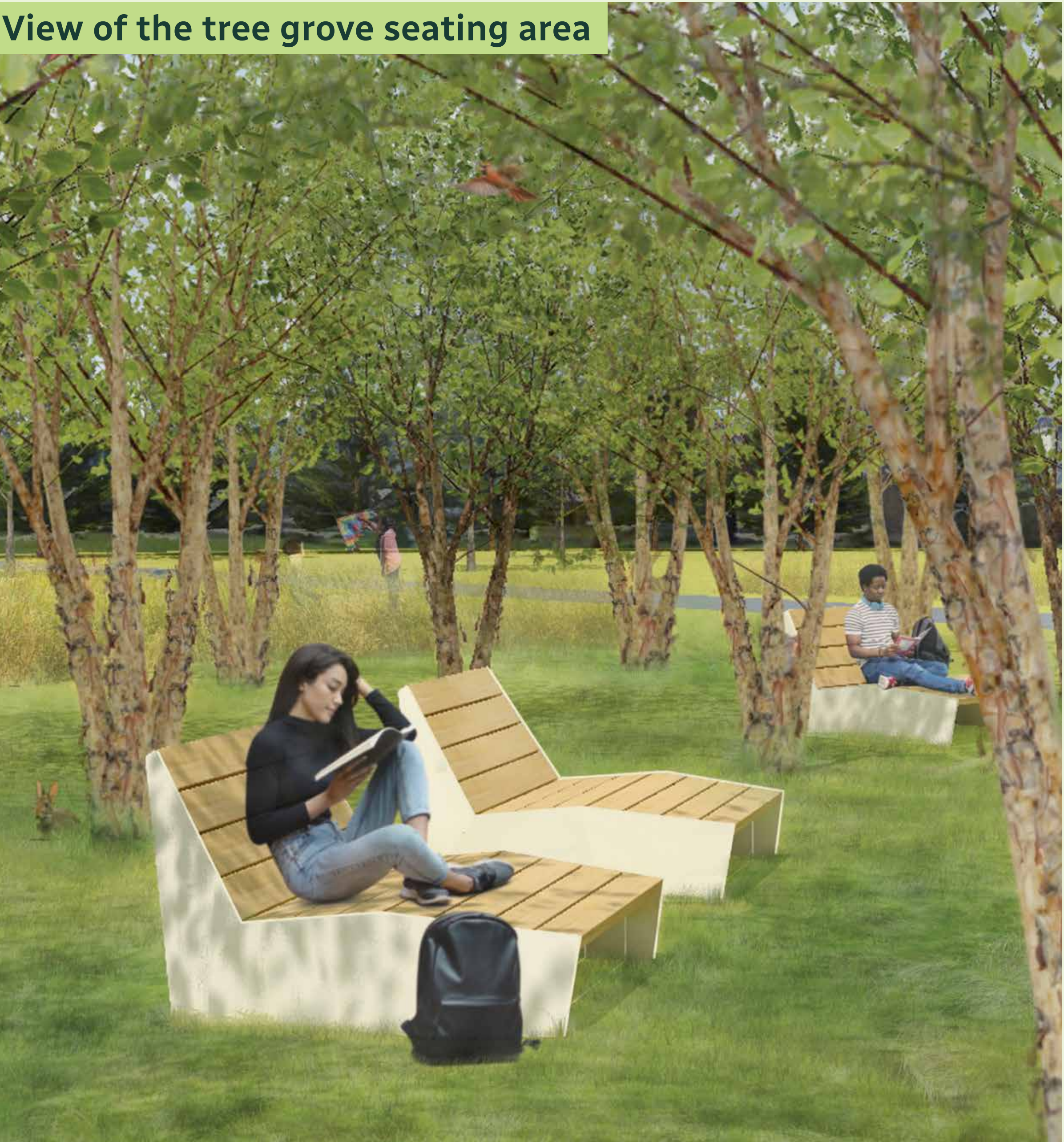
View of the tree grove seating area