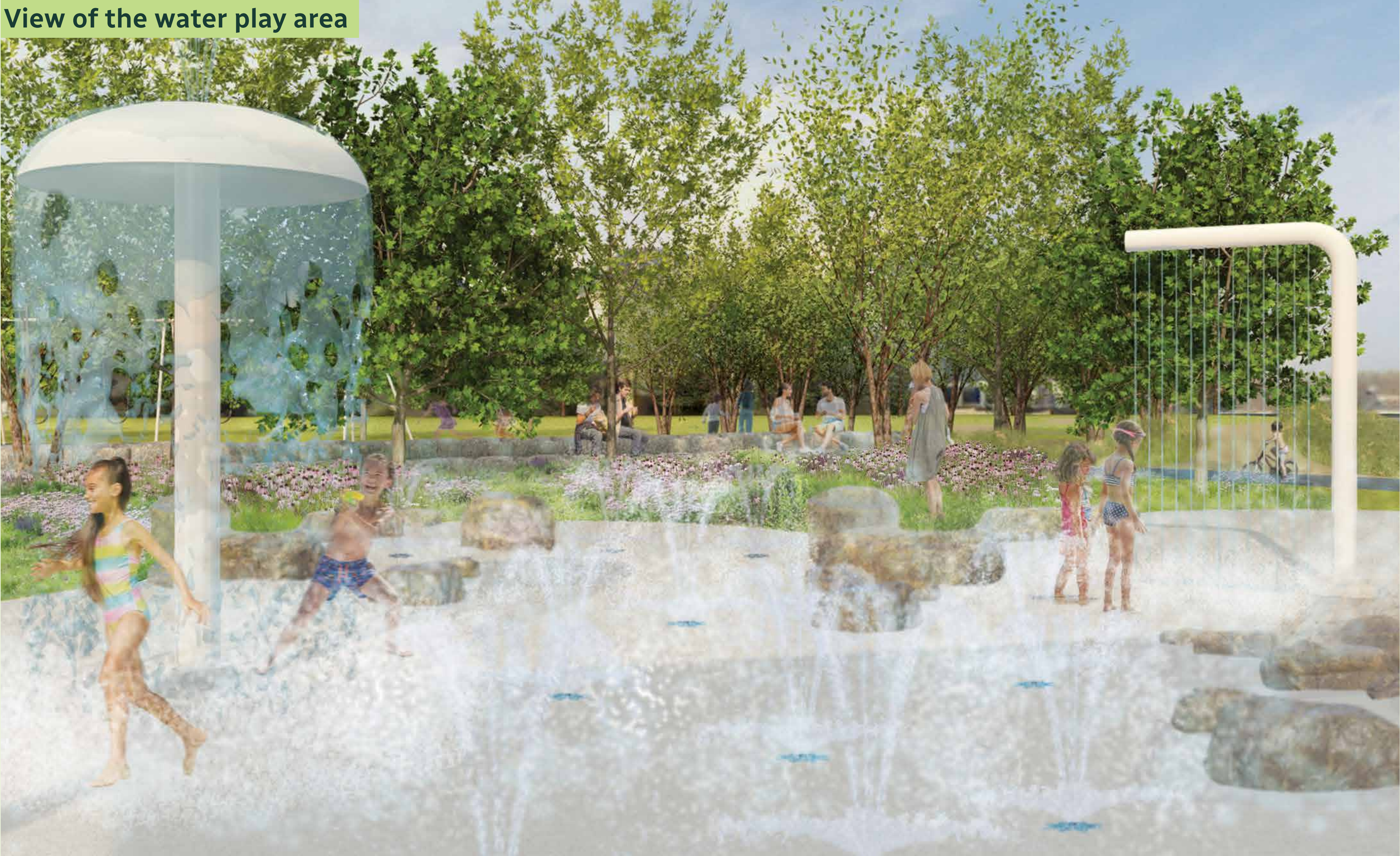
View of the water play area