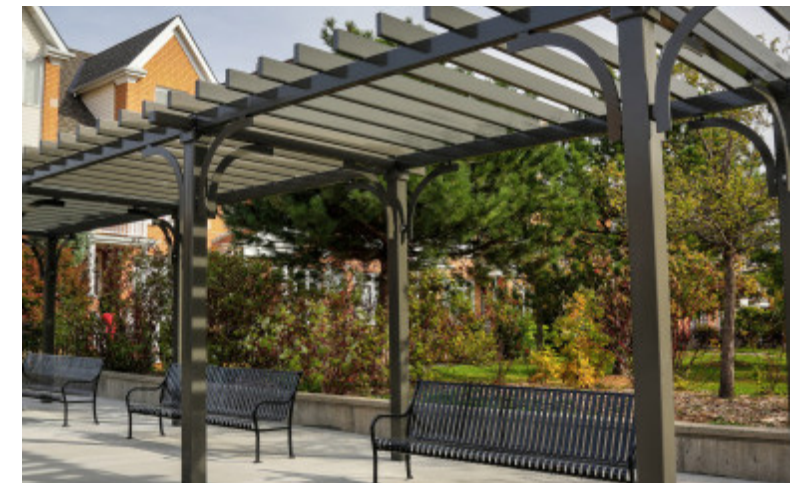
6 SHADE PERGOLA