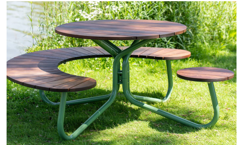
5 CLUSTER TABLE