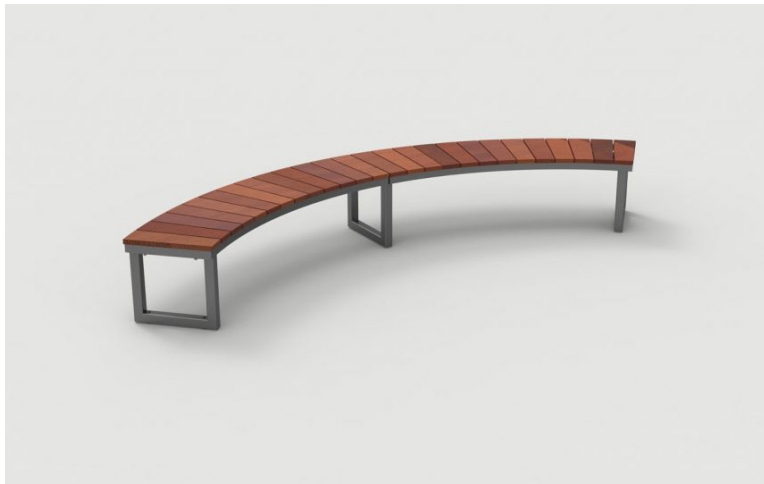
2 CURVED BENCH