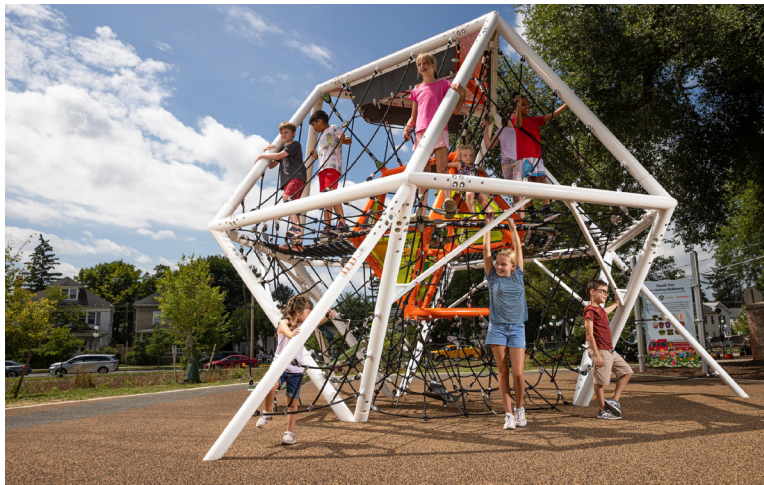
1 PLAY STRUCTURE