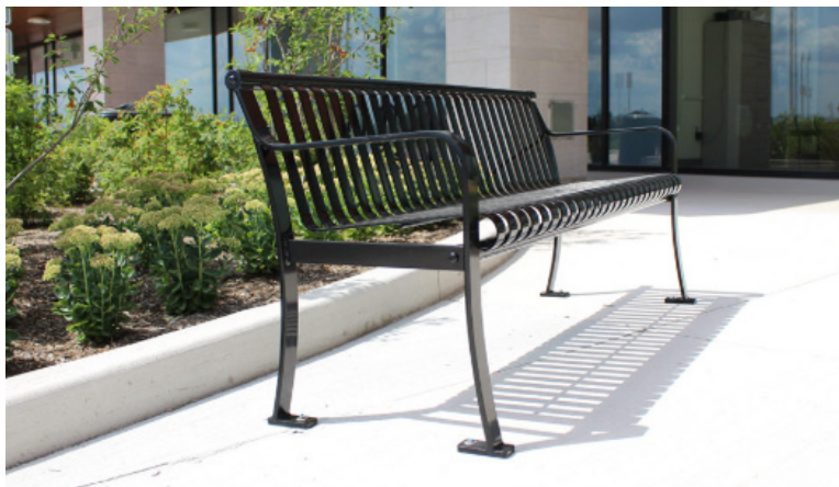
3 METAL BENCH