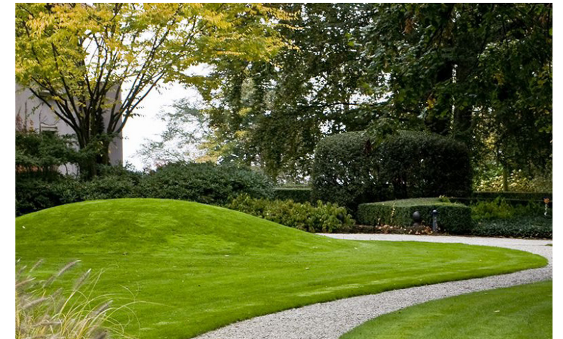
4 MOUNDED LAWN